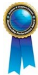
Blue Ribbon Membership Performance Award